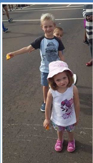
Oranges for the runners