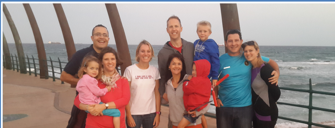
The runners and their supporters before the race